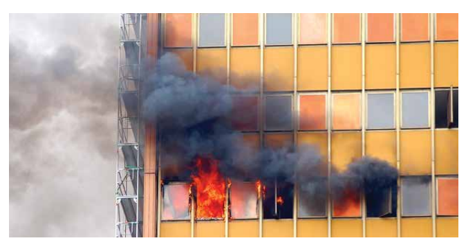
FIRE PROTECTION & UPGRADE

Maintenance, upgrade or replacement of fittings, accessories, locks and gaskets.