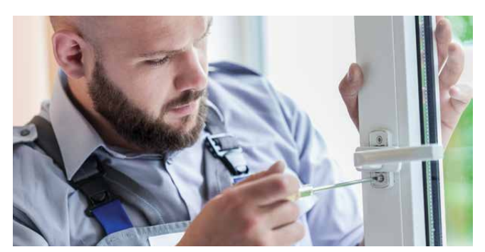
DOORS, WINDOWS & ACCESSORIES INSPECTION

Proper insulation of the building assemblies to optimize thermal performance and reduce energy consumption.