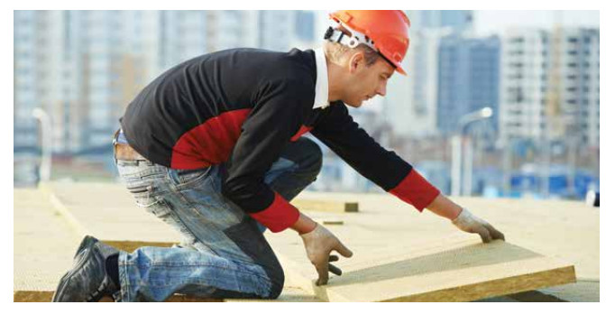
THERMAL, AIR & WATER INSULATION

Perform aluminium system & DGU quality control for corrosion, cavity noise, pillowing, fogging and delamination.