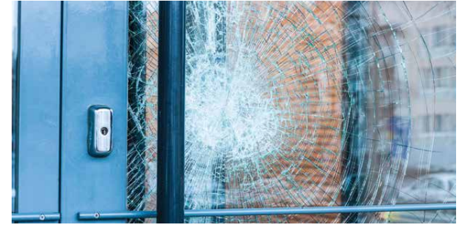
SAFETY - BURGLARY PROTECTION

Review and improve fire and smoke proofing systems to ensure fire protection and smoke and heat exhaustion.